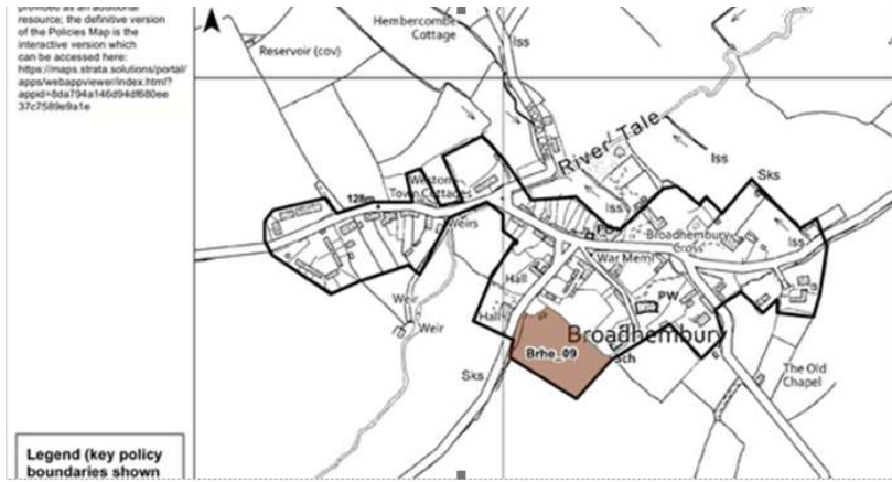
East Devon Local Plan Reg 19 consultation insert policies map