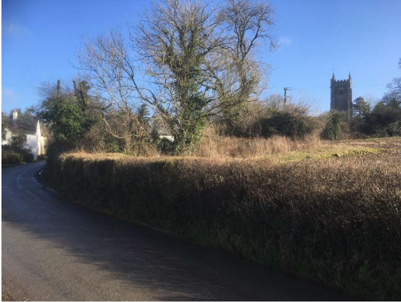
View from access road to Listed Church