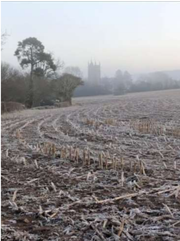
View across field to site