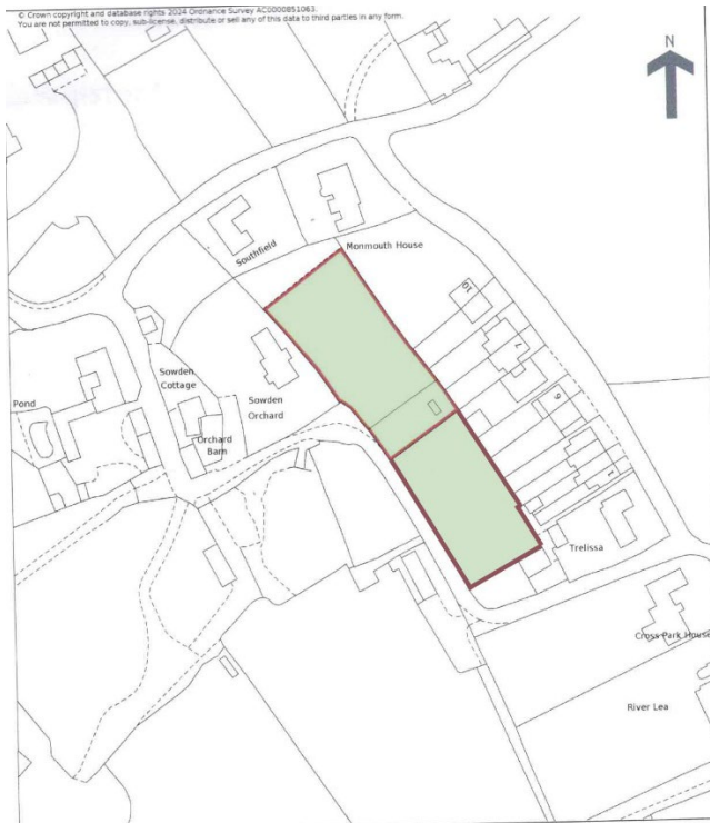
Plan above showing land reference Is1311n, plus additional land Title DN75262

Re: Consultation Response to the East Devon Local Plan 2020-2042 (Regulation 19 Consultation) - Site Reference: Is1311n, Land to the Rear of Dawlish Park Terrace, Courtlands Lane, Lymington, EX8 5AA, plus additional Land Title DN752646