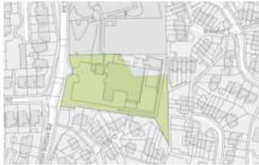
Above: Screenshot of draft allocation from emerging proposals map.

Former Millwater School at Bottom Road (Honi_06) is allocated for 30 homes under this policy. The accompanying policies map shows the allocated area shaded in green as shown in the screenshot below.