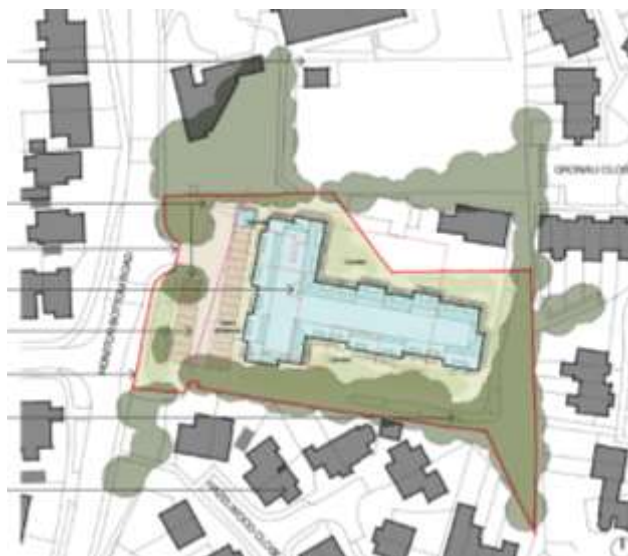
Above: Care home layout submitted with pre-app ref. 24/0069/PREAPP.

A pre-application enquiry for the redevelopment of the site to provide a 68-bed care home was submitted on behalf of Frontier Estates Ltd to East Devon District Council on the 19 th July 2024 under ref. 24/0069/PREAPP. A meeting to discuss the pre-app was held with the case officer on the 25 th September 2024 and a formal written response was issued by the Council on the 17 th December 2024. The meeting and subsequent response confirmed that the principle of a care home in this location would be acceptable. As such, a full planning application is being prepared for submission in June 2025. The care home site is shown below.