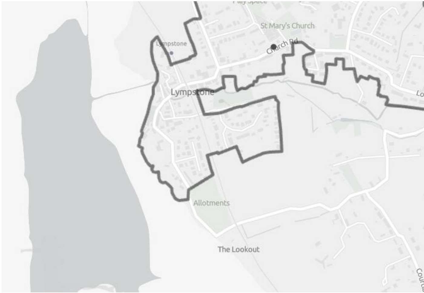
Extract from Interactive Policies Map Reg.19 Consultation Stage