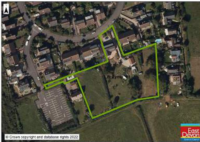
Overhead photo of Lymp_01