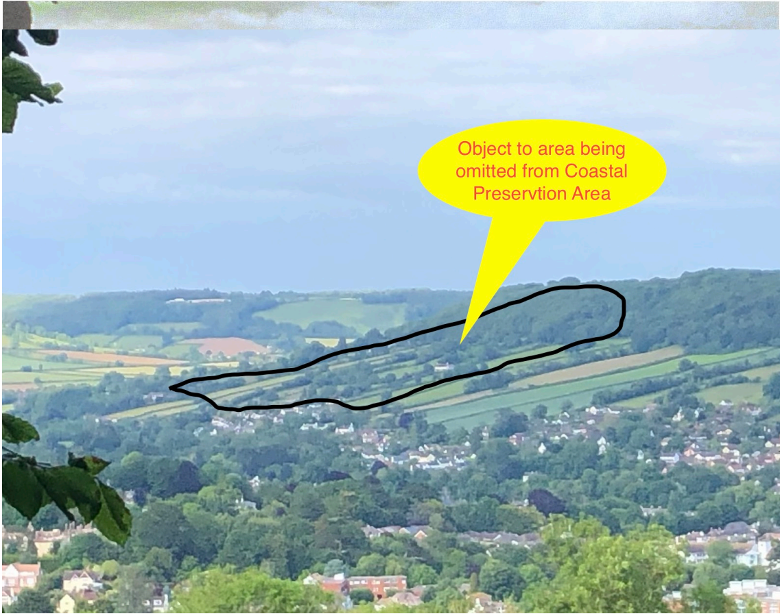
Photo 1 - From Peak Hill toward Fortescue and A3052