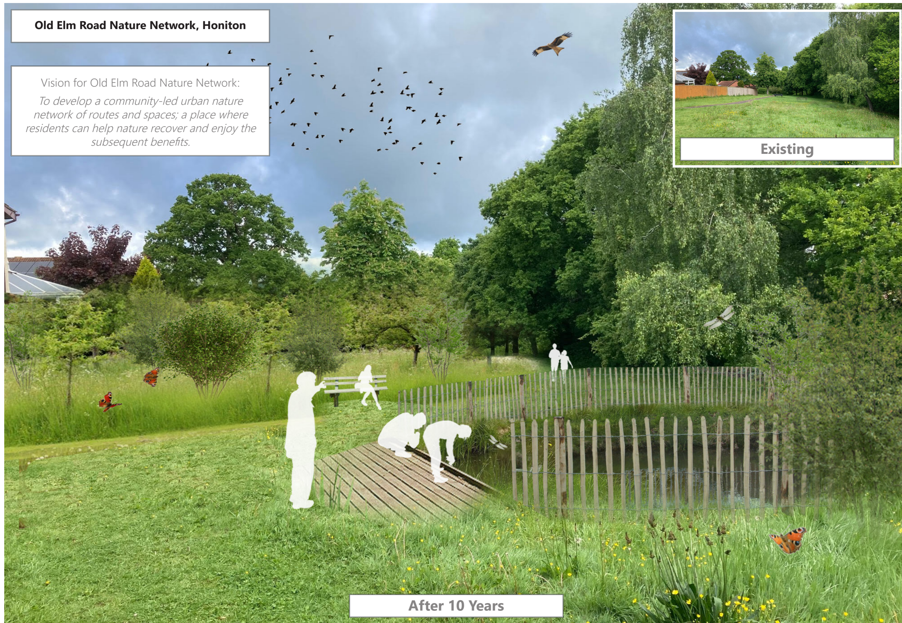
After 10 Years