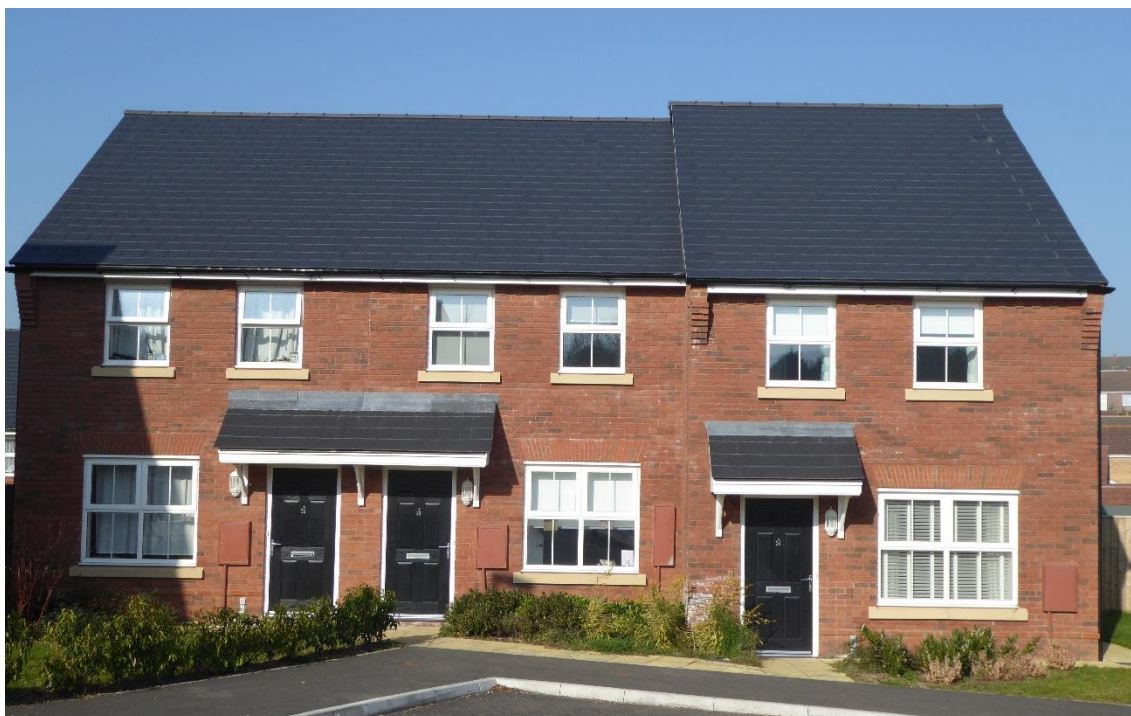
A group of three affordable homes on a site in Ottery St Mary

2.4 The following table (figure 2.1) provides a summary of each comment, alongside the council's response showing how those issues have been addressed in the SPD. Changes to the SPD as a result of the comments are noted in italics . Note that the paragraph numbers refer to those in the draft SPD published in March 2019.