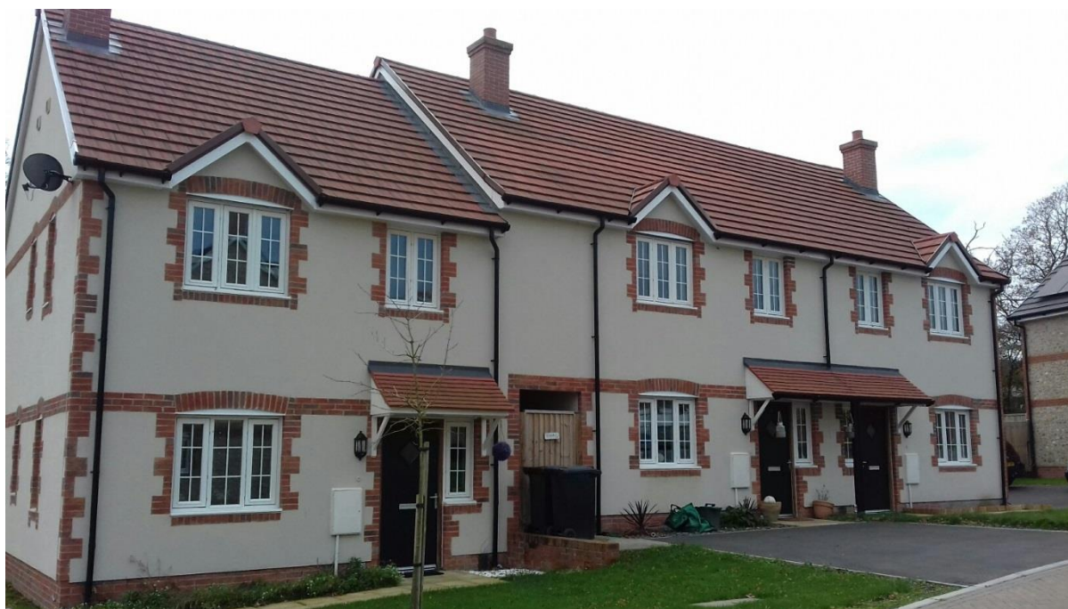
Affordable housing on a rural exception site in Kilmington