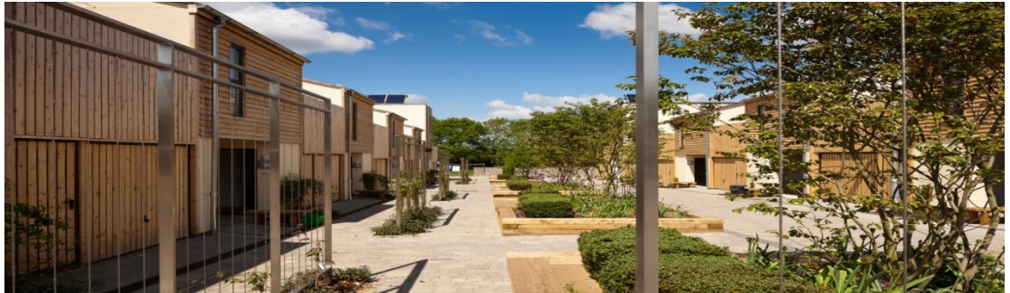
Thicket Mead, Midsomer Norton, Radstock, Somerset

The Master Plan Document indicates some good examples of urban architecture. In particular; Upton - West Northampton, Thicket Mead - Midsomer Norton, Lime Tree Square - Street, New Hall- Harlow and Sherford - Plymouth.