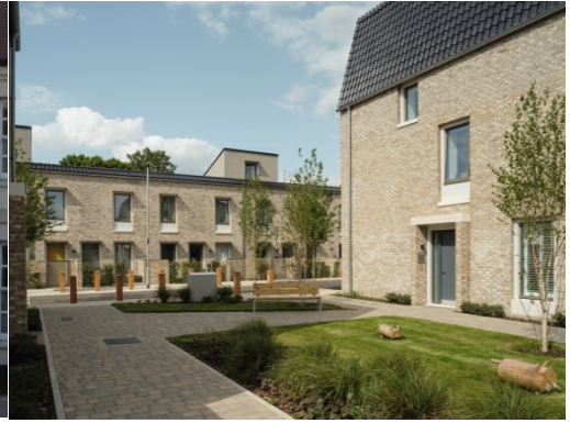
Goldsmith Street, Norwich