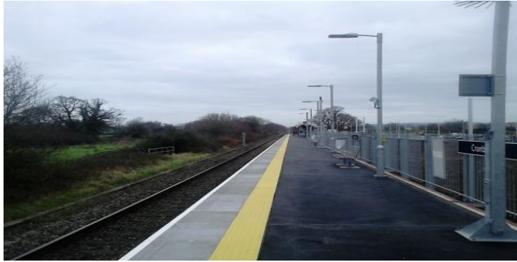
Cranbrook Station, Devon (N.B Single Track)

The Devon Metro proposals for enhanced rail services in the Exeter area include aspirations for additional local services between Axminster and Exeter. This is being progressed as a local scheme by Devon County Council. This would require a second passing loop between Honiton and Exeter. Funding must be made available for this, without delay. The saga has been running for years with no apparent action. The rail system should allow at least one train every half-hour to run in each direction. South Western Railway made promises in a report in 2017 but significant improvements have not materialised.