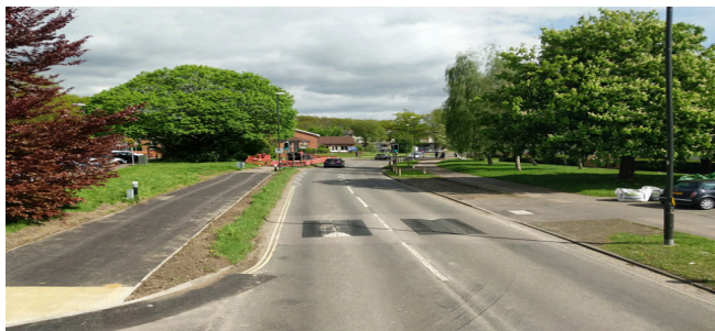
Pound Lane, Crawley' West Sussex (If you could do it in the 50's you can do it today)

It is worth noting that especially at weekends, the main "old A30" has for years been a favoured route for recreational cyclists, but all the new developments from the Rockbeare Straight westwards are making this road less attractive for such users.