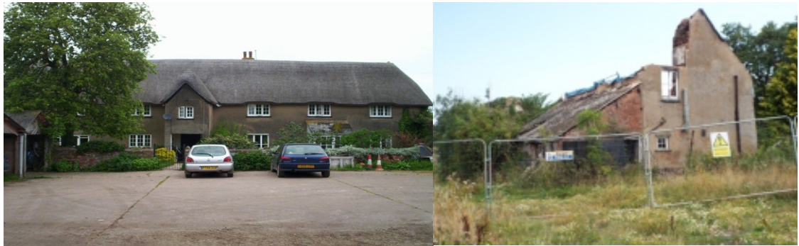
Tillhouse Farm, Cranbrook, Devon – Before and after suspicious fire

So what is happening at the 15 th Century, Tillhouse Farm?, Land put aside for parking has now been built on, so this limits the historic building use for community or commercial / business start-ups. Clearly, this should not happen in future and that historic and listed building should be preserved in its environmental context. It is shameful and deplorable that Cranbrook Council have stated in their submission that, ‘restoration of the farm complex and bringing it back to its original heritage as a public asset appears undeliverable’ . It is legally the responsibility of Persimmon Homes to reinstate this fine listed building and they have the ability to give this to the community for public good - EDDC should be held to account. In another case, complete historic farmsteads to the west of Cranbrook have been completely demolished. Not the best form of conservation!