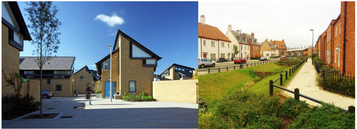
New Hall, Harlow, Essex