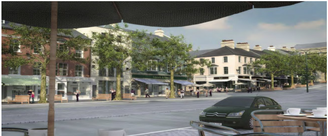
Sherford, Proposed Town Centre, Devon

According to recent published reports, the District Council is currently in talks with the developers to extend deadlines to start building a Town Centre. Although developers promised that the first five high street units would be built in the designated Town Centre area before 2,000 homes are occupied it is not happening. This highlights the folly of a 'developer led' town planning project.