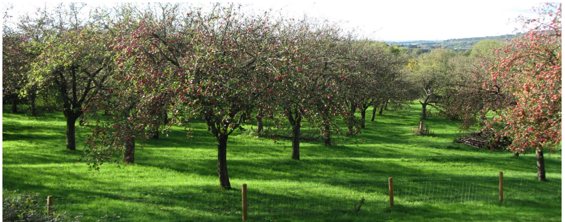
Orchard in Whimple, East Devon

An element of some sensitivity in planning is evident as seen by mature trees which have been able to be retained (unable to trace information on mature trees that have actually been lost). However, as far as I am aware the proposed Grange development there are at least 16 mature oak trees under threat, in what is currently the Grange parkland to the south of the London Road. Trees are vital for absorbing carbon dioxide and have great aesthetic appeal, recreational value and preserve part of natural environment and wildlife habitat.