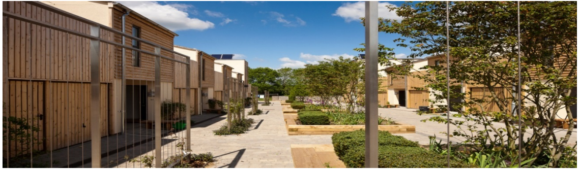
Thicket Mead, Midsomer Norton, Radstock, Somerset

The Master Plan Document indicates some good examples of urban architecture. In particular; Upton - West Northampton, Thicket Mead - Midsomer Norton, Lime Tree Square - Street, New Hall- Harlow and Sherford - Plymouth.