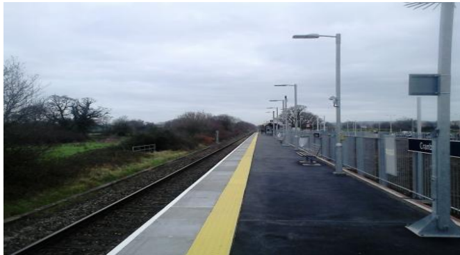
Cranbrook Station, Devon (Single Track)

It could be argued that doubling the entire line from Salisbury to Exeter would enhance the capacity of the national rail infrastructure. It is especially necessary from Pinhoe to Axminster. Funding should be made available for this, as a priority. This should be set in the Cranbrook Master Plan and any land should be acquired for this purpose. At present one train/hour reduces demand.