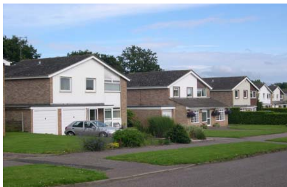
Top - The Village Street.