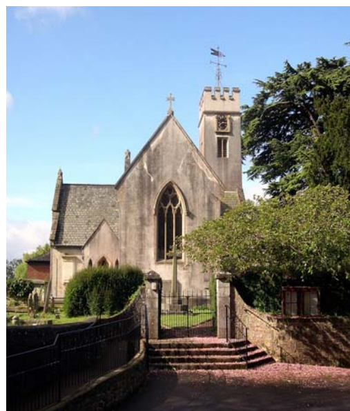
Clyst St. Mary Church