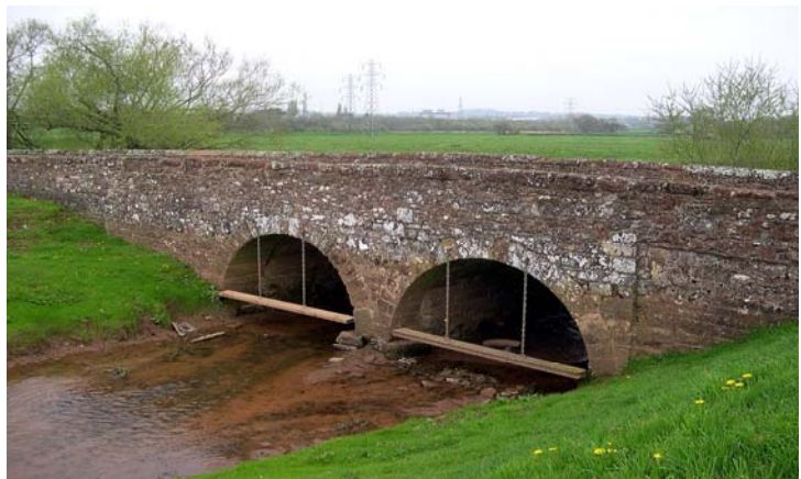
Top - White Lodge.