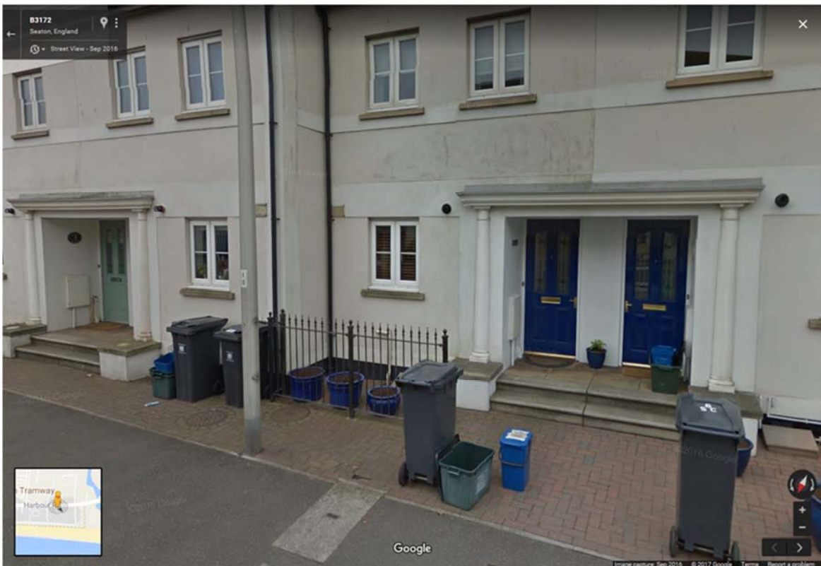
Figure 4: Residential properties along Harbour Road, Seaton