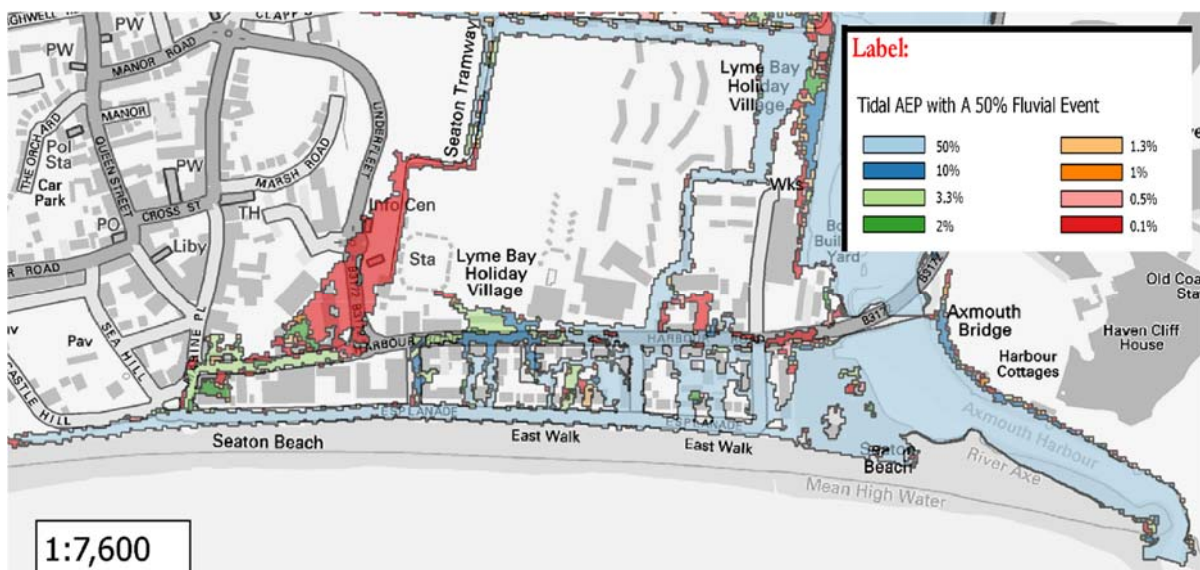
Figure 2: Present day flood risk from wave overtopping of coastal defences under a range of extreme return period events (from Lyme Bay Coastal Flood Forecasting Phase 2 (CH2M, 2017)).

The NRD was used with little modification/verification. The database was filtered to exclude properties considered to be either upper floors, water compatible (e.g. ponds) or low flood damage costs (e.g. post boxes). Residential properties with zero floor area were taken as being upper floor properties and therefore excluded. A list of excluded categories is reported in Annex A. As part of the initial data review property ID 29601312 was moved from not-classified building (MCM code '999') to warehouse (MCM code '4').