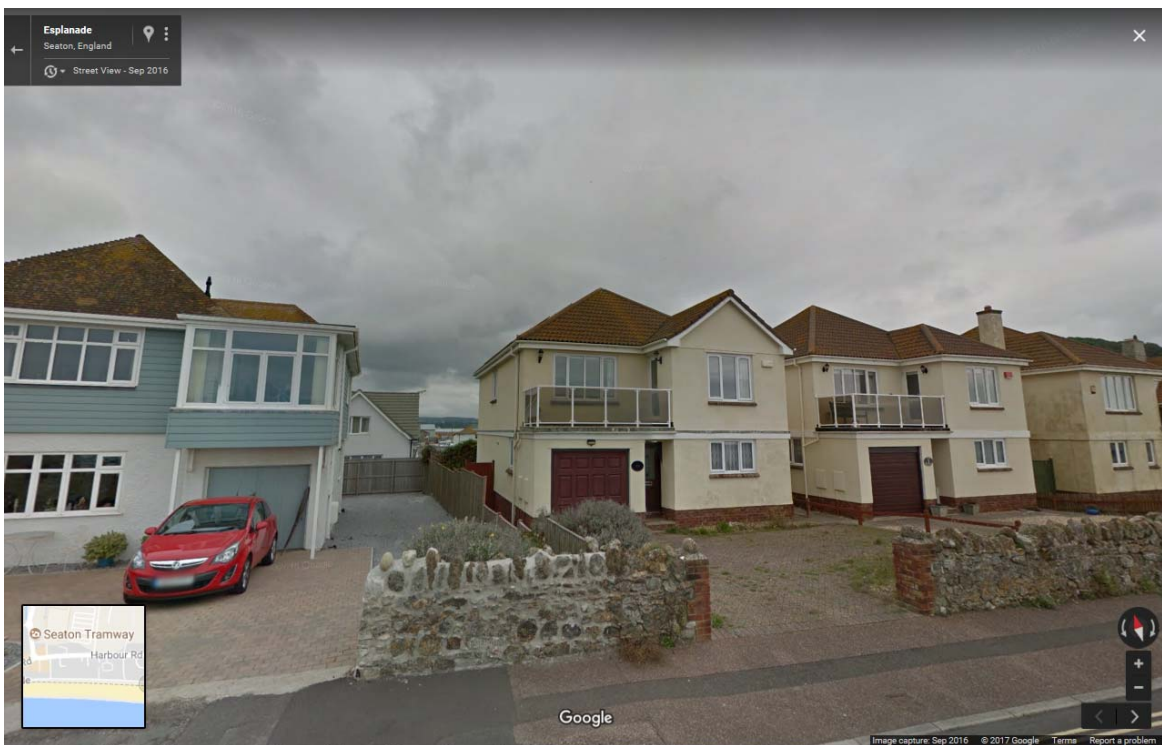
Figure 5: Residential properties along the Esplanade, Seaton

The following components have been incorporated in the damages: