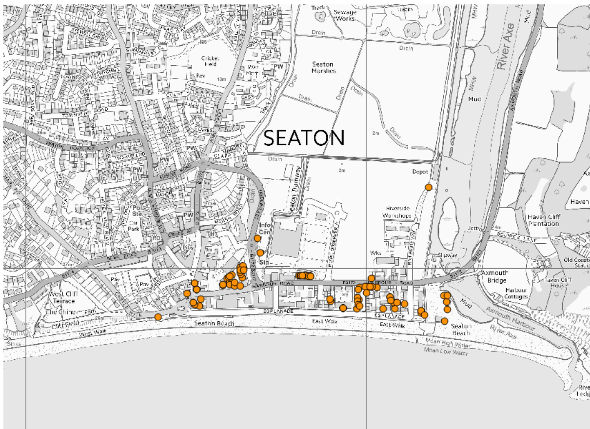
Figure 3: Distribution of NRD data in the study area.

Property information was obtained from the NRD 2014. Residential properties were described using the code '1' and were not described using the two digits MCM code to distinguish between detached, bungalows, etc. Residential property values have been capped using market values obtained from the "Land Registry" for Devon, July 2016. Figure 3 shows the distribution of the NRD in the study area.