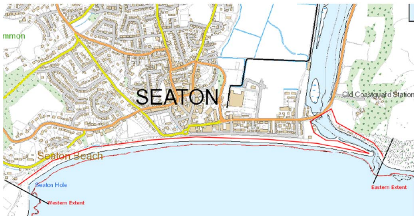
Figure 1: Extent of the study area